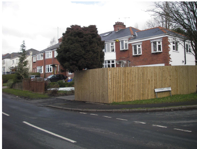
Photograph 2 Fence as viewed from the junction of Twentywell Lane and Twentywell Rise.