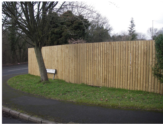
Photograph 4 Street scene to the south east of number 153